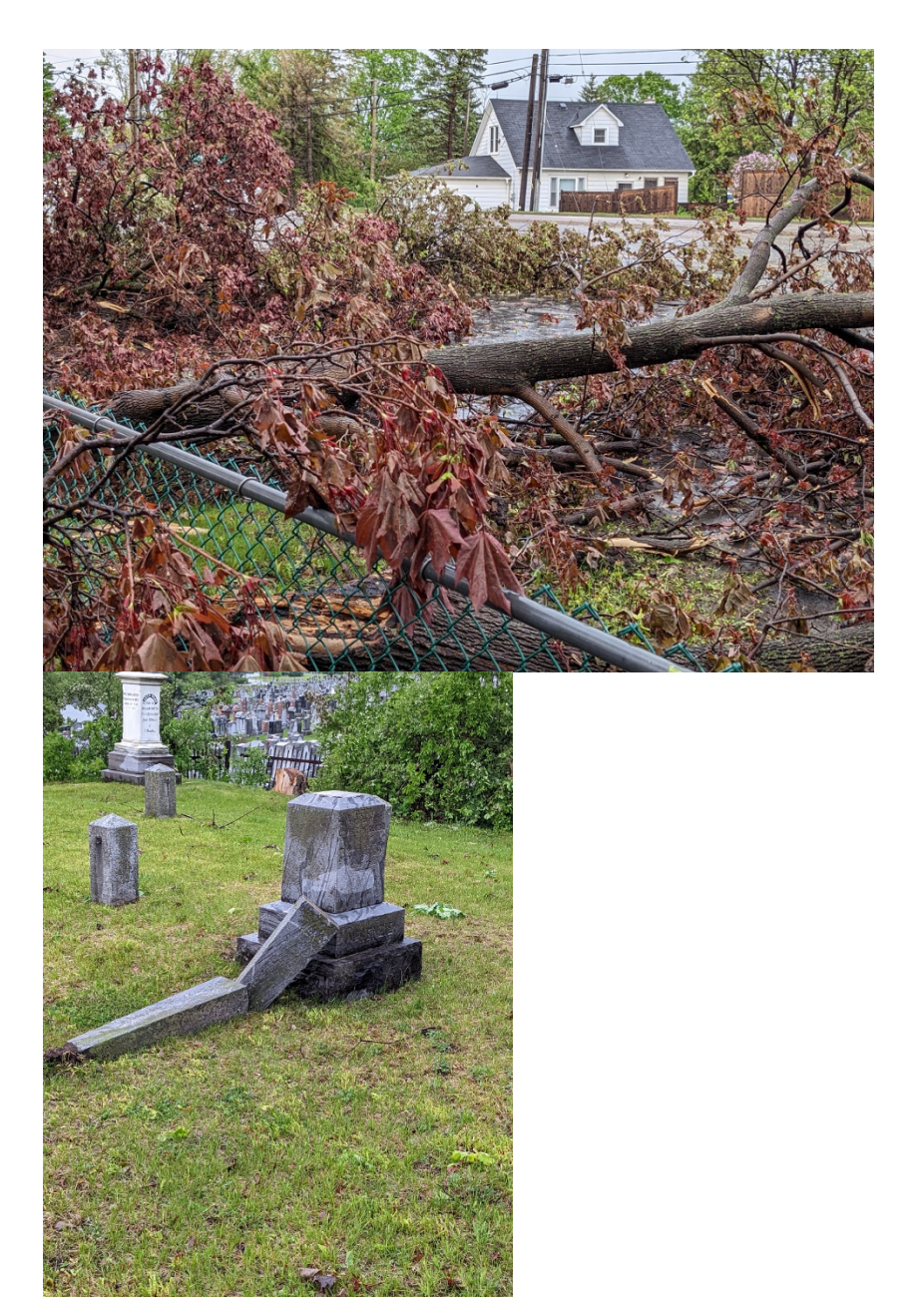
Maple Trees fallen across Bank Street at the front of the Cemetery Toppled