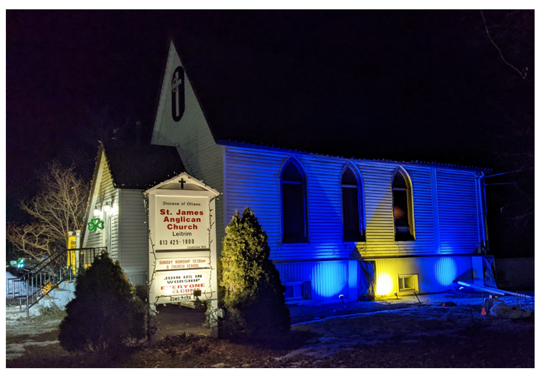
St. James Remembers Ukraine in March 2022 with the colours of the Ukrainian Flag

Within a couple of day, the war in Ukraine began and from the very beginning, I could not understand how this was going to end. And as of February 2023, it is still going on. Too many casualties, too much destructions, affecting soldiers and civilians alike. It disgusts me. And for what? It all seems to be a power play by Russia to exert its will over the Ukrainian people, who do not want to be subjugated. Sadly, I only see more death and destruction. As of this date, I still don't see a path towards peace.